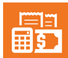
NET PRICE CALCULATOR

CashCourse is a real-life guide to taking charge of money and personal finances. CashCourse online personal finance tools help students build real-life-ready financial skills.