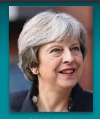
FEATURING -The Right Honourable Theresa May

Prime Minister of the United Kingdom (2016-2019) Member of Parliament for Maidenhead