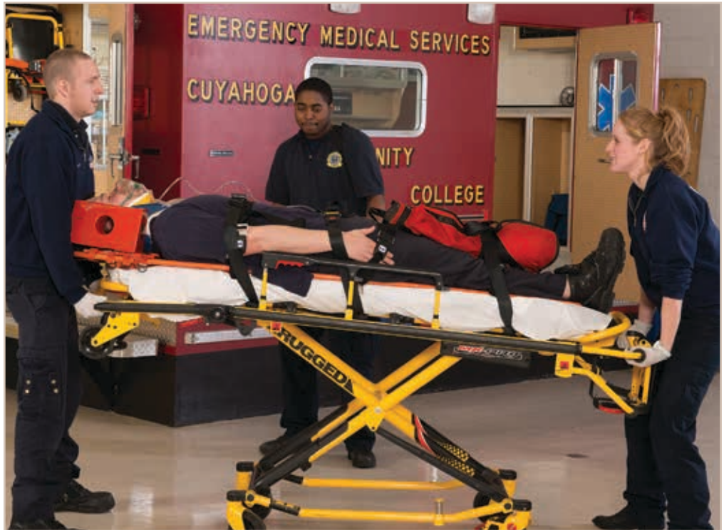
Tri-C provides training for many in-demand public safety occupations in Northeast Ohio.

“Generous support from the KeyBank Foundation will enable Cuyahoga Community College to expand its public safety training program to meet local