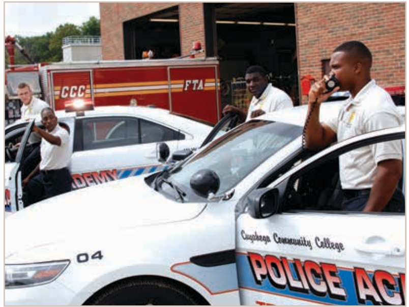
A new grant from the KeyBank Foundation will help to expand Tri-C's public safety training program.

Enhancing training for future public safety professionals is the focus of a brand-new, $1.4 million grant awarded by the KeyBank Foundation. The grant will support high-quality training for students pursuing careers as law enforcement officers, firefighters, paramedics and other in-demand public safety occupations in Northeast Ohio.