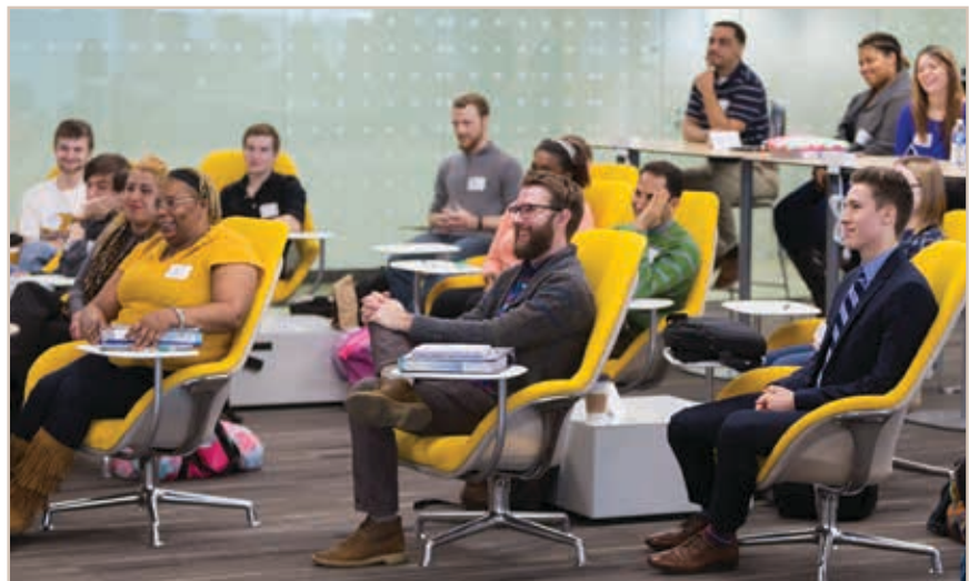
First day of classes for Jack, Joseph and Morton Mandel Scholars