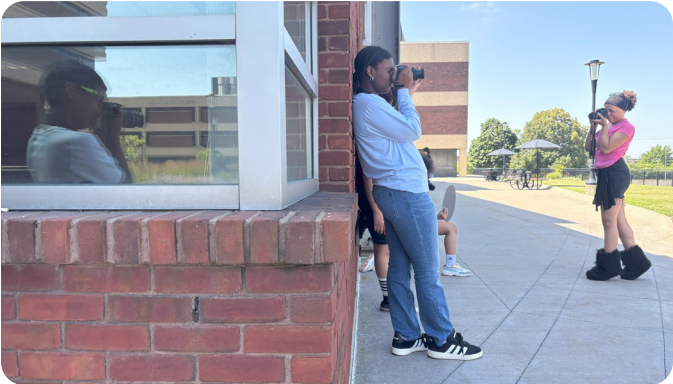
Photo Editing and Digital Storytelling

Ages 11-14 | Free (Capacity: 15 students)