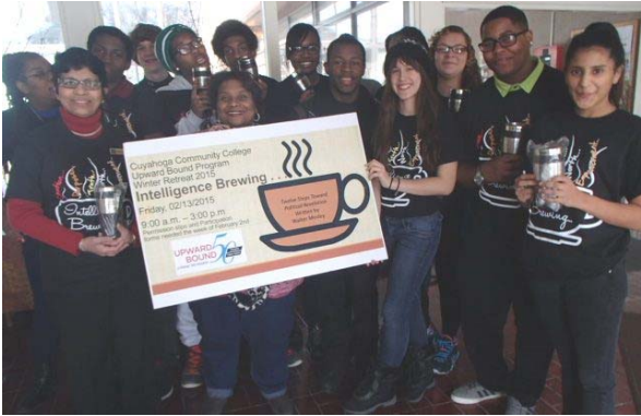
Winter Retreat: Upward Bound students shared their insights into the book "Twelve Steps to a Political Revelation."