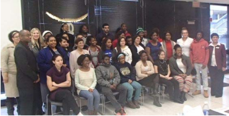
Alumni Panel: Upward Bound collaborated with Upward Bound Math & Science for a Q&A with alumni from both programs.