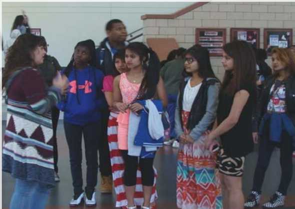
Miami University Visit: Upward Bound students listen to the tour guide list highlights of the campus on their visit to Miami University.