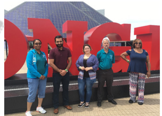
Metro Trio SSS students and staff outside the Rock Hall