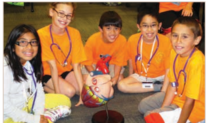
Students in Tri-C's Health Careers Summer Academy learn about the health care professions.

This project serves students from the Cleveland Metropolitan School District, expanding their knowledge base of health careers, allowing them to experience health careers programs with positive employment outlooks for the coming years and helping to expand the pipeline to health professions. Providing an early introduction and guidance to students considering professional goals in health-related fields, the project helps students become better prepared to enter and succeed in college. ■