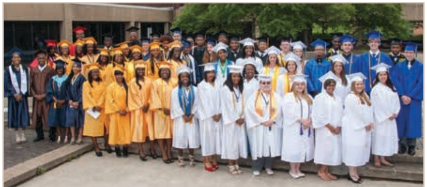
In 2012-13, 70 students graduated from Tri-C's High Tech Academy

Since the launch of the program in 2000, more than 1,000 high school students have earned college credit prior to high school graduation, and 52 high school students have graduated with their associate degrees as they received their high school diplomas. Nearly 70 HTA students graduate