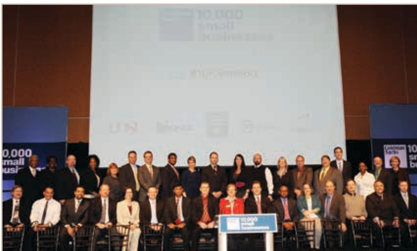
Graduation day for business owners from the 10,000 Small Businesses initiative.

The Goldman Sachs Foundation continues its five year commitment to the Greater Cleveland area ($5 million in grants to support business education through Cuyahoga Community College and $10 million in lending capital). The purpose of the 10,000 Small Businesses initiative is to allow local small businesses to create jobs and stimulate economic growth. The program also offers business advice, technical assistance and networking opportunities to participating small business owners through an extensive network, built in partnership with Goldman Sachs. "Access to Capital" is a topic covered throughout the curriculum and through