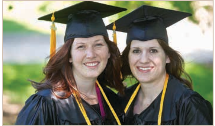
Tri-C students at Commencement, Spring 2013

The Foundation's Directors played a major role in achieving this milestone through their own contributions and by broadening the reach of the Foundation throughout Northeast Ohio. Cuyahoga Community College Foundation Board Chairperson,