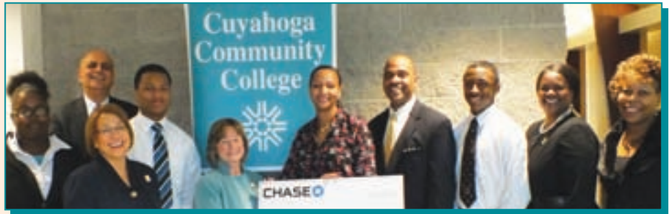
Representatives from JPMorgan Chase and Cuyahoga Community College with Freedom Academy participants.

The Cuyahoga Community College Foundation and the College appreciate the generous support of the JPMorgan Chase Foundation for the Invest in People – A Legacy for the Future Campaign to offer our community's youth access to a high-quality educational program that will cultivate critical thinking skills, increase literacy achievement and support leadership development.