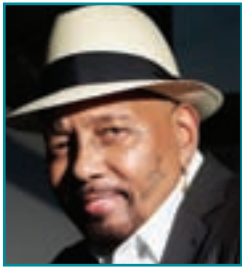
Aaron Neville April 19