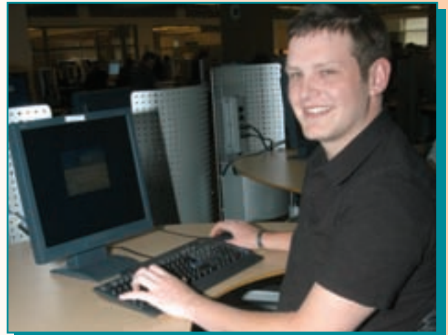
The Veterans Scholarship Fund provides support for student Veterans at Cuyahoga Community College.