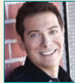
Michael Feinstein April 26