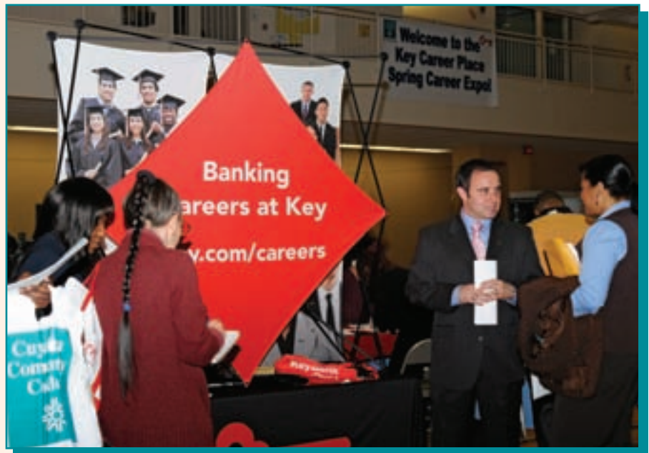
Career Fair at Cuyahoga Community College

The Ohio Board of Regents' controlling board recently funded the Cuyahoga Community College Foundation's request for the Ohio Means Internships and Co-Ops – Means Careers project. The project will deliver 105 internships and cooperative education experiences in five key JobsOhio industries: advanced manufacturing, business functions, energy, information technology, and polymers and chemicals. In this project, Cuyahoga Community College partners with Lakeland Community College and the Northeast Ohio Council on Higher Education (NOCHE) to provide employer-focused support. More than 10 employer partners have committed to provide paid internship and cooperative education experiences for students.