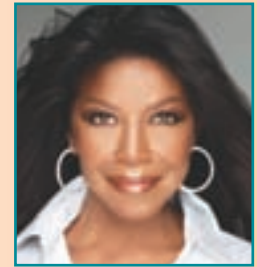
Natalie Cole April 27