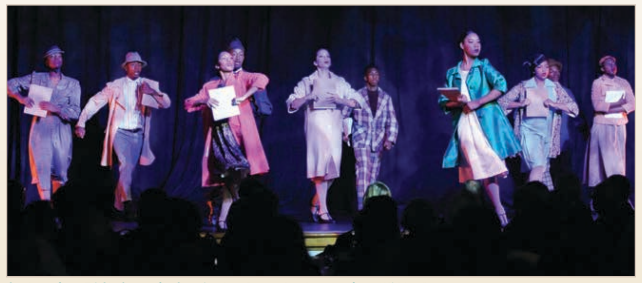
Students from Tri-C's Center for Creative Arts Dance Academy perform "Hidden."