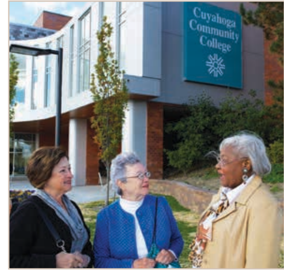
Consider a gift to Tri-C in your financial planning.

Would you like more information? Visit www.tri-c.edu/give and select Planned Giving for downloadable brochures outlining the best assets for giving, how to design your gifts and how to find