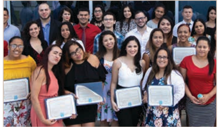
More than 70 Hispanic students, some of whom are shown here received scholarships at the College's Annual Hispanic Council Luncheon.

Microsoft has donated to support the Cleveland Codes Tri-C Software Developers Academy, which provides fast-track technology training to help qualified individuals move into IT jobs. Following the 16-week course, students complete 12-week