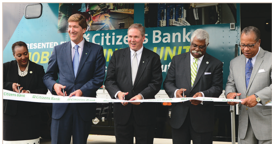
Leaders from Tri-C and Citizens Bank celebrate the dedication of the Mobile Training Unit.