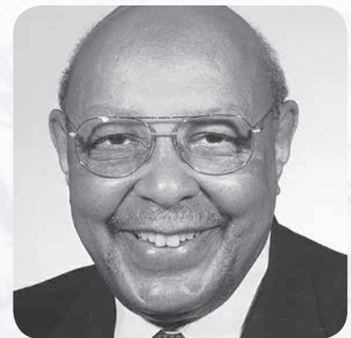
Congressman Louis Stokes