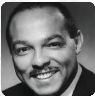
Mayor Carl Stokes