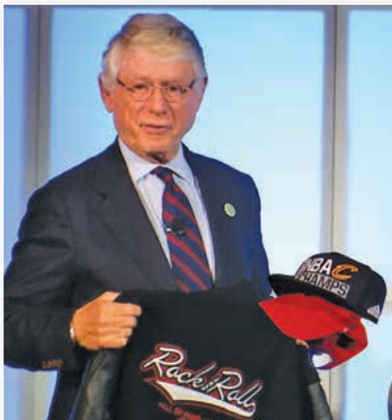
Mr. Ted Koppel with gifts presented to him on behalf of Tri-C students for his participation at the event benefiting student scholarships