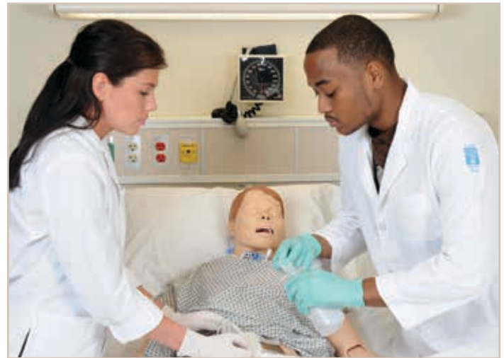
Students in Nursing and Health Careers will benefit from Medical Mutual’s continued support