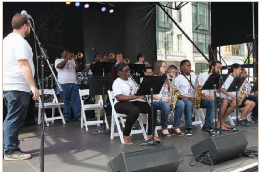
Tri-C Summer Camp musicians perform at JazzFest

National Endowment for the Arts arts.gov