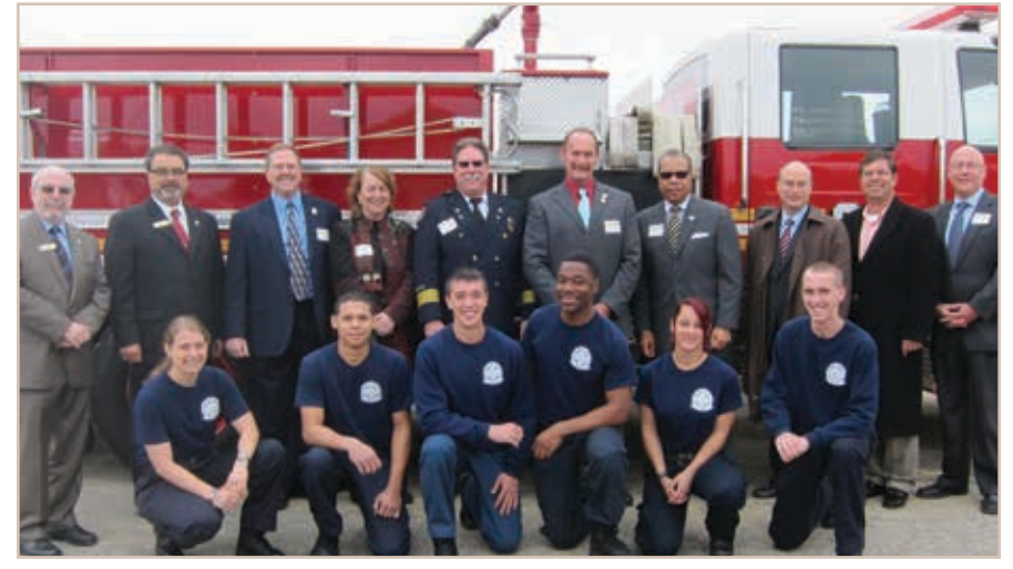
Members of the community joined Tri-C officials and students in the College's Fire Training Academy to celebrate the groundbreaking of Tri-C's new Public Safety Training Center of Excellence.

course; a trench area to practice confined space maneuvers and a retention pond for water rescue drills. The new complex – the only one of its kind in Northeast Ohio – will serve over 400 police and fire departments in 12 counties.