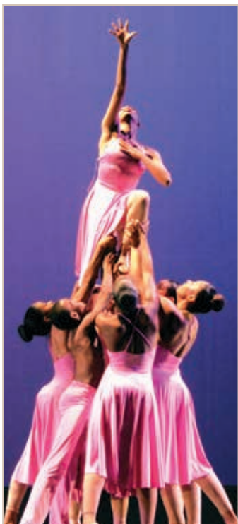
Tri-C Dance Academy students