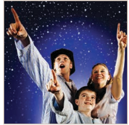
The cast of Tri-C's Western Campus production of PETER PAN

Center for Creative Arts students are prepared to thrive in rewarding careers and have the academic backgrounds to pursue additional college credentials at four-year institutions. Many students who complete credit and noncredit programs go on to enroll in nationally acclaimed institutions or seek employment to help build economic, social and cultural prosperity in our region. ■