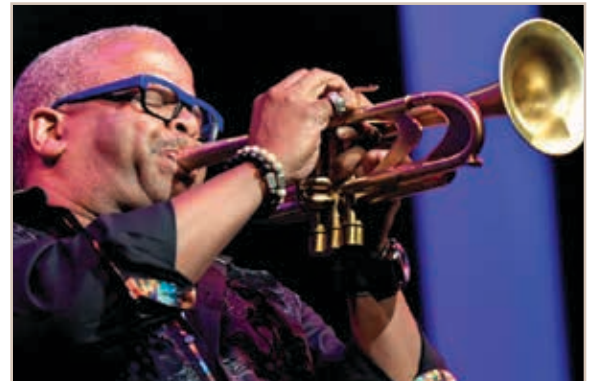
Mr. Terence Blanchard

Grammy Award-winning trumpeter and composer Terence Blanchard is sharing his knowledge and passion with students and fans across Northeast Ohio during his two-year artist residency at Cuyahoga Community College. A longtime collaborator with film director Spike Lee, the musician invited a group of Tri-C film students to review the process of scoring a film, which was made possible through support from the John P. Murphy Foundation. “The role for a score varies from film to film,” he said. “It depends on the director’s vision.” Blanchard also emphasized the importance of education when talking with the group. “It will carry you beyond your talent. Talent is just a seed, you need to water and nurture it.”