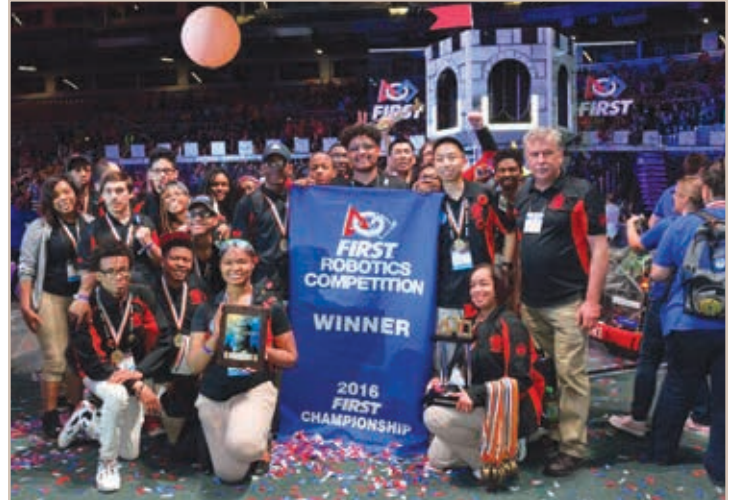
On Saturday, April 30, 2016, Tri-C's Youth Technology Academy robotics team earned the FIRST Robotics STRONG HOLD Championship in St. Louis, Missouri. Nearly 650 teams from around the world competed, including Israel, Canada, Mexico, Brazil, Australia, Turkey, Taiwan, China and the Czech Republic. Congratulations World Champs!

For more than 15 years, the College's Youth Technology Academy has supported in-school youth in completing high school, while fostering college preparation and growing interest in the important career areas of science, technology, engineering and mathematics. Participants – from the Cleveland Metropolitan School District – completed assessments upon entry into the program and were identified as at-risk for college success. After completing the program, 95 percent graduated from high school and 86 percent entered college.