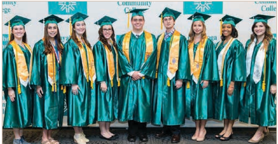
Tri-C's Honors Program Fellows

The College family was tremendously excited to see the inaugural class of Honors fellows graduate. The Honors Fellowship Program is an investment in student success ensuring our students are able to complete their college degree and represents one of seven Scholars Programs at Tri-C. Support for the Honors Program Fellowship is provided through numerous scholarship funds.