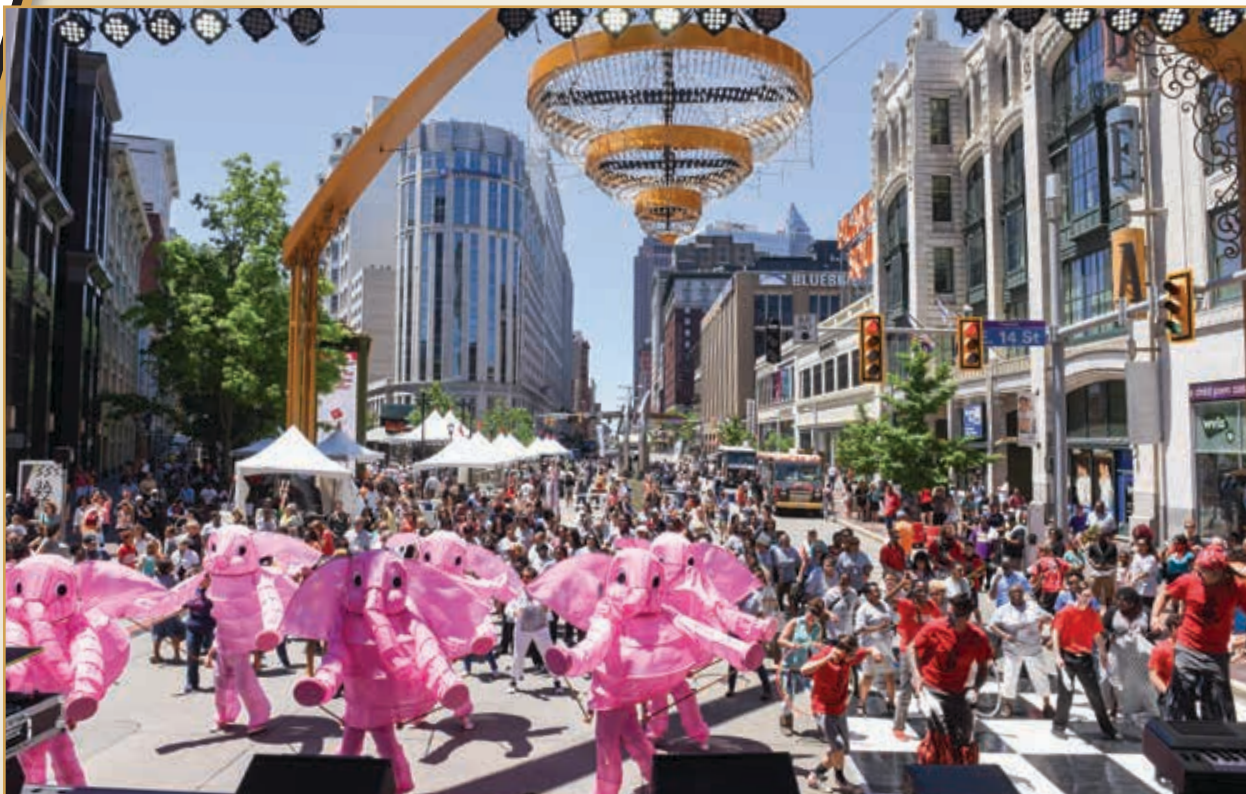
Keyed-Up for JazzFest drew hundreds of guests to Playhouse Square for a fun, parade-style festival