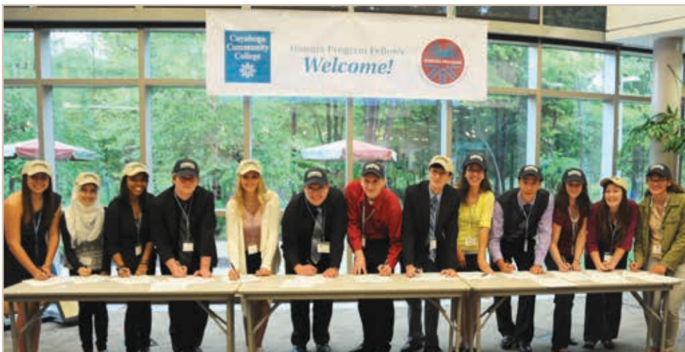
The inaugural Honors Program Fellowship class 2014

An Honors Program Fellowship debuting this fall at Cuyahoga Community College offers high-achieving students scholarships to cover tuition, fees and books as they work toward an associate degree. The inaugural Fellowship class features 14 students who graduated from high school with a minimum 3.5 grade point average and stellar ACT/SAT test scores. By entering the scholarship program, they commit to being full-time students and earning a degree from Tri-C within two years.