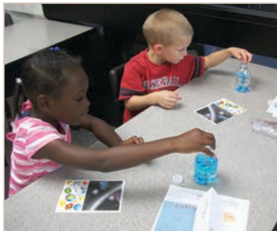
Kindergarten students learn about satellites through artistic activities that reinforce their knowledge.