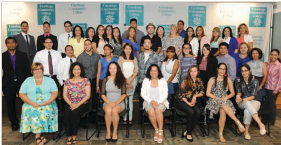
Eighty-four students were honored at the 2014 Hispanic Scholarship Luncheon

The Cuyahoga Community College's Hispanic Council hosted its annual Hispanic Scholarship Luncheon on July 18th at the Jerry Sue Thornton Center. The event is held in honor of Hispanic access and achievement in higher education and featured four students who were chosen to "tell their stories." The Tri-C Foundation awarded $80,000 in scholarships to Hispanic students for the 2014-15 academic year. These scholarships were made possible thanks to the generous support of community donors, including AT&T, KeyBank and The Collection Auto Group.