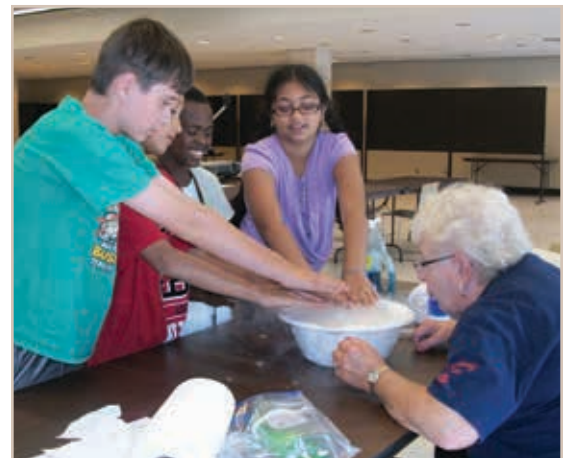
SEMAA students experience properties of physics "firsthand" with dry ice, under the guidance of experienced instructors.

parents and guardians are invited to participate in the SEMAA Family Café, which provides parent training on subjects ranging from cultural diversity and preparing for college to parenting skills and community awareness. SEMAA serves approximately 625 students during the academic year and summer camp sessions and approximately 500 students through its youth outreach programs. The Cuyahoga Community College Foundation appreciates the continued support of community partners in creating pathways to STEM careers for our youth. ■