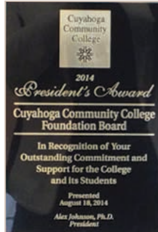
The 2014 President's award