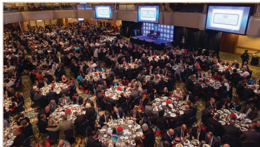
Sold-out 2014 Presidential Scholarship Luncheon at the Renaissance Cleveland Hotel