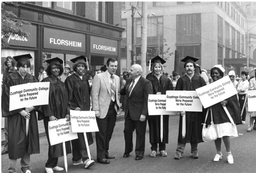
Square To Square Parade 1983