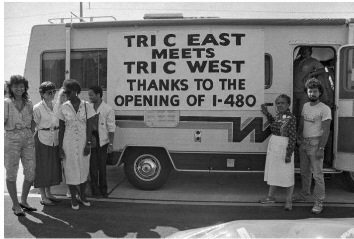
Opening Recruitment Van 1987