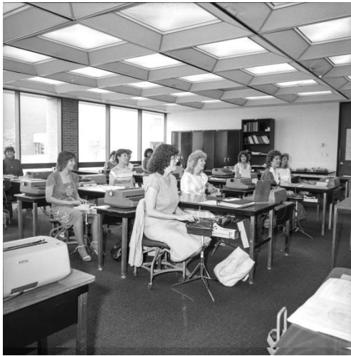
Court Reporting Class 1984