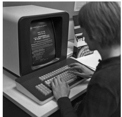
Graphic Communications Western Campus 1983