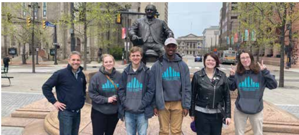
▲ History of Cleveland tour with Teaching Cleveland at the Mayor Tom Johnson memorial on Public Square