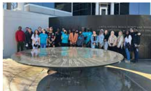
▲ Mandel Scholars on "The Roots of Social Justice: Alabama Civil Rights Trip" at the Civil Rights Memorial Center in Montgomery