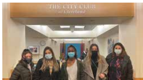
▲ Mandel Scholars at the City Club of Cleveland